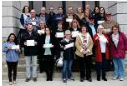
Photo: Receiving of check from Omaha Foundation/Crawford County

A huge Thank You to the following who enabled this terrific semi-private area which is ready for use: