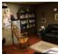
A last look at our space at Our Savior Lutheran before packing

Brief Version: Packed. Moved. Resettled. (well mostly).