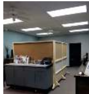
Kessel Construction designed & built our walls. They are very practical, sturdy and beautiful!

The Omaha Community Foundation approved a grant for $2500 for Crossroads. The grant is made possible through the Crawford County HF 2302 Grant Fund. An Advisory Committee to the foundation, made up of citizens from Crawford County, votes on the applications made by approved charitable organizations within Crawford County. The grant money must be for tangible items utilized in a way which improve the quality of the community.