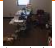
Making due at our new space with basics that were in one place--or the other

Room by room, box by box, we made our new day 'home' great space for our work. Volunteers, totally confused on the schedule by this point, popped in to help when they could, as it had been laughable. I was GRATEFUL for their dropping by to be a friendly face, an opinion or two on setting up, and spirit of helping.